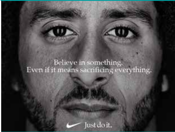
Figure 2 Nike