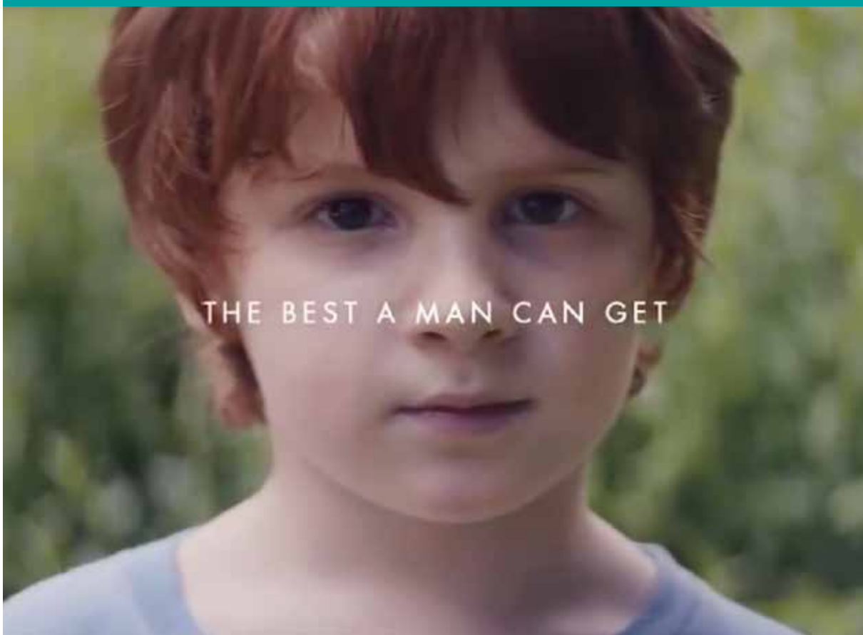
Figure 1 Gillette