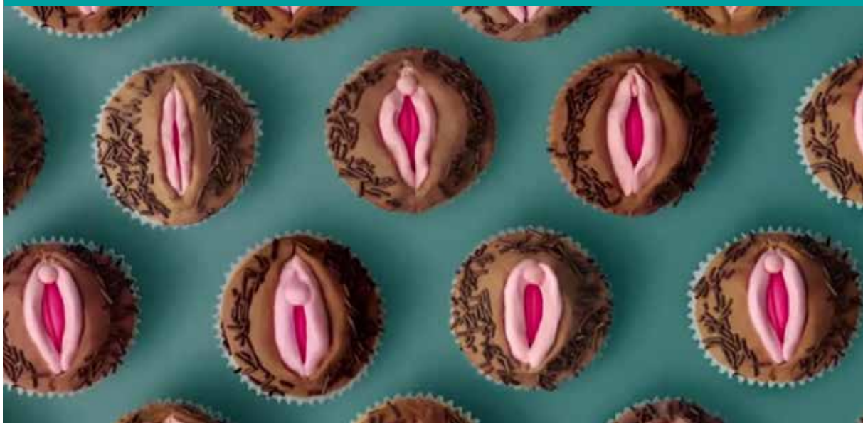
Figure 3 Libresse