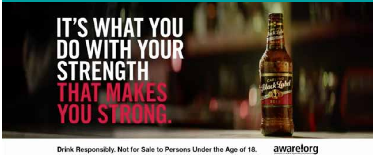
Figure 5 Carling