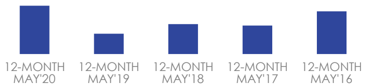
Use of BBQ at Lunch/Dinner

Barbequing is a social family affair for all Canadians with both males (60%) and females (40%) attending to the grill.