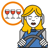
Driving under the influence of alcohol or drugs