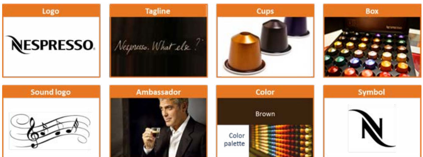
Figure 1 - Nespresso's collection of brand assets

Our point of view is that brand assets do not necessarily have to be meaningful – sometimes it is fine when a brand asset only evokes the brand name without also evoking the brand image. However, it certainly helps when brand assets support what the brand wants to stand for. Nespresso provides a good example: the brand has a rich and diverse collection of distinctive brand assets, all of which support the sophistication that the brand wants to be known for.