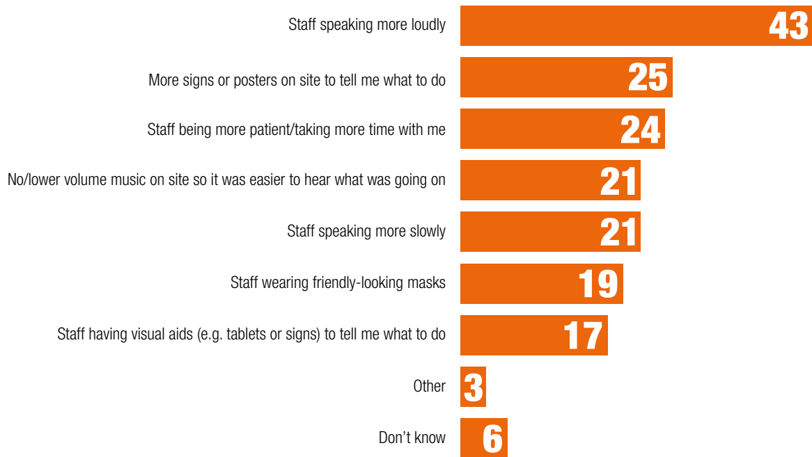
Figure 3 Which of the following would have made it easier to achieve what you wanted to do? (% selecting each)

All respondents who experienced some detriment as a result of wearing a mask or staff wearing a mask (126)