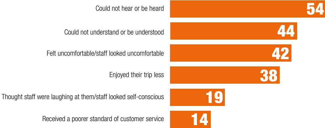
Figure 2 Impact of wearing a mask (% selecting each)

All respondents who experienced some detriment as a result of wearing a mask or staff wearing a mask (126)