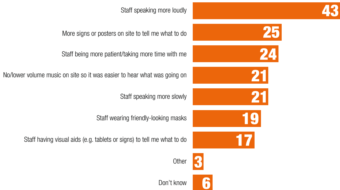
Figure 3 Which of the following would have made it easier to achieve what you wanted to do? (% selecting each)

All respondents who experienced some detriment to their trip as a result of wearing a mask or staff wearing a mask (126)