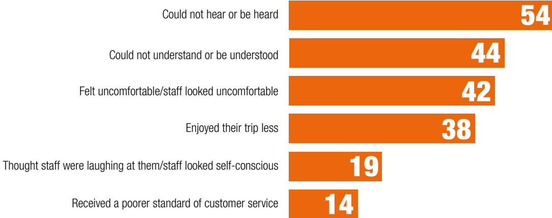
Figure 2 Impact of wearing a mask (% selecting each)

All respondents who experienced some detriment to their trip as a result of wearing a mask or staff wearing a mask (126)